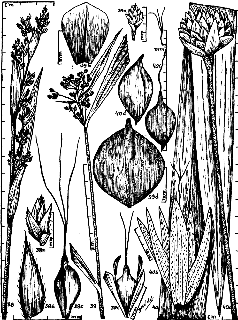
Figs. 38-40 : 38-38c. Machaerina rubiginosa (Spreng.) Koyama. 39-39d. Hypolytrum nemorum (Vahl) Spreng. 40-40d. Mapania palustris (Hassk. ex Steud.) F.-Vill.