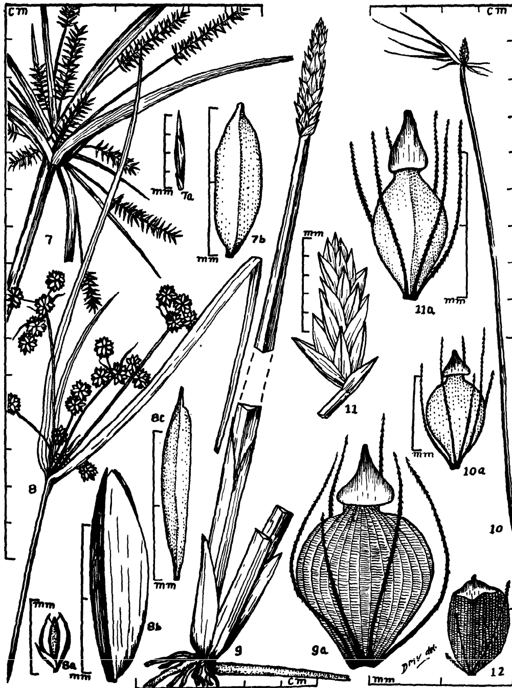
Figs. 7-12 : 7-7b. Cyperus cyperoides (L.) O. Ktze. 8-8c. C. pseudokyllingioides Kuekenh. 9-9a. Eleocharis acutangula (Roxb.) Schult. 10-10a. E. congesta D. Don. 11-11a. E. tetraquetra Nees. 12. E. retroflexa (Poir.) Urb.