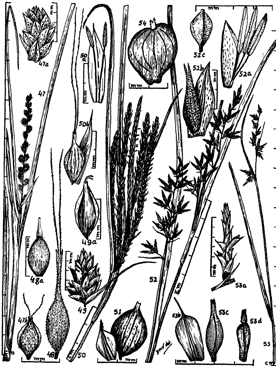
Figs. 47-54 : 47-47b. Carex thomsonii Boott. 48-48a. C. teinogyna Boott. 49-49a. C. alta Boott. 50-50b. C. rubrobrunnea Clarke. 51. C. prescottiana Boott. 52-52c. C. vesiculosa Boott. 53-53d. C. repanda Clarke. 54. C. baccans Nees.