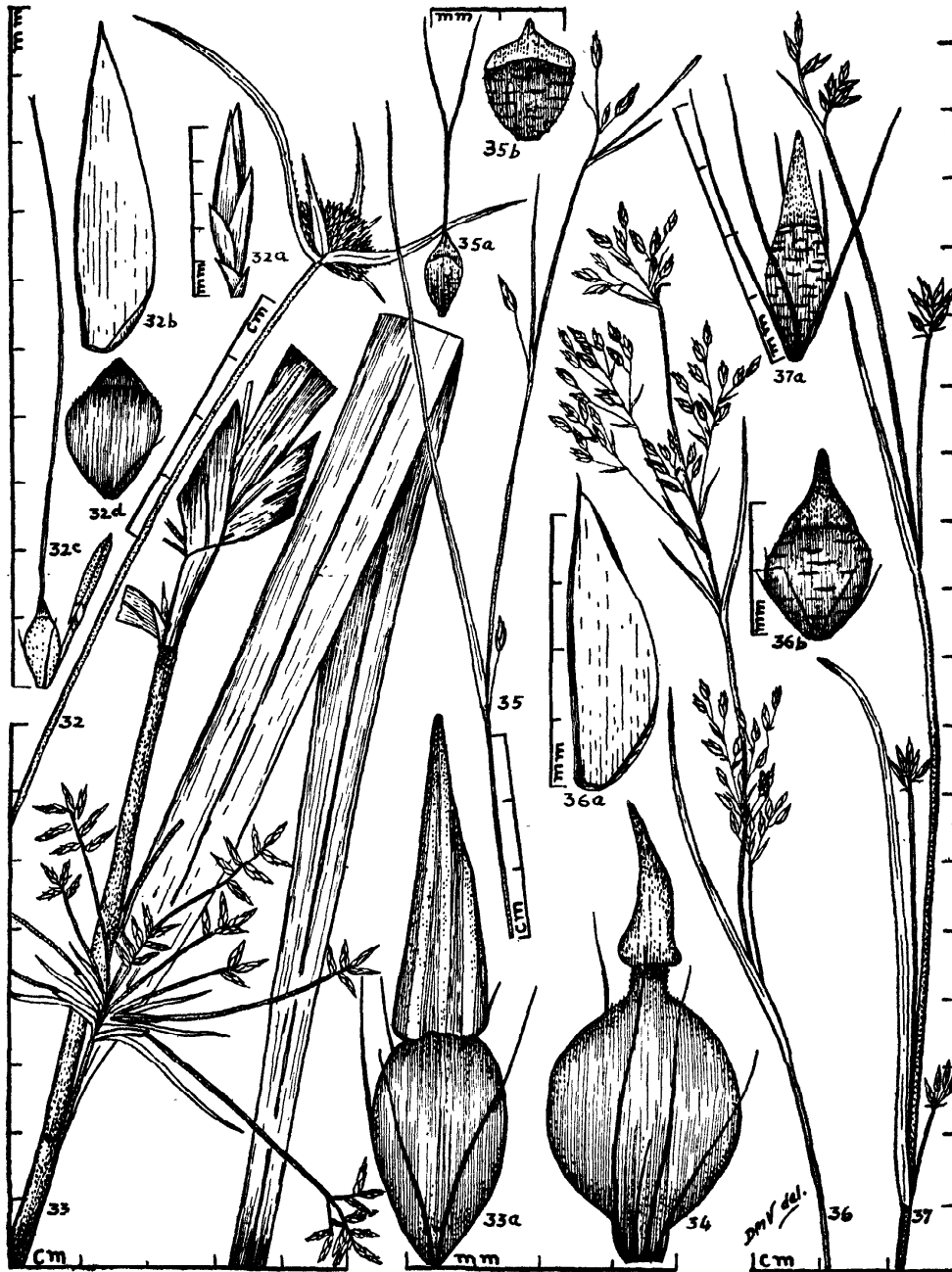
Figs. 32-37 : 32-32d. Rhynchospora rubra (Lour.) Makino. 33-33a. R. corymbosa (L.) Britt. 34. R. hookeri Boeck. 35-35b. R. gracillima Thw. 36-36b. R. rugosa (Vahl) Gale. 37-37a. R. rugosa var. griffithii (Boeck.) Verma & Chandra.