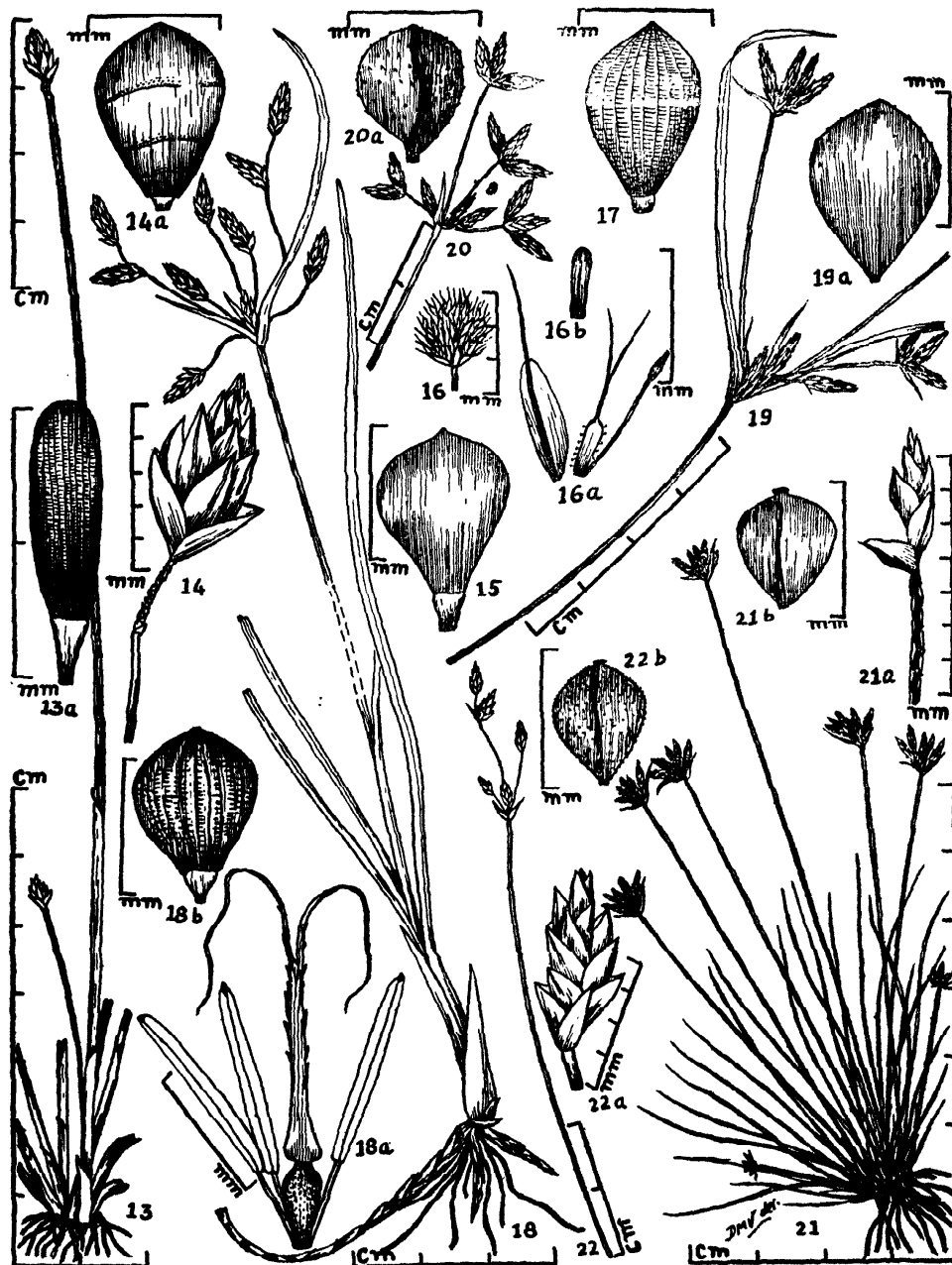
Figs. 13-22 : 13-13a. Fimbristylis tetragona R. Br. 14-14a. F. nutans (Retz.) Vahl. 15. F. tristachya R. Br. 16-16b. F. dipsacea (Rottb.) Clarke. 17. F. dichotoma (L.) Vahl. 18-18b. F. stolontifera Clarke. 19-19a. F. hookeriana Boeck. 20-20a. F. eragrostis (Nees) Hance. 21-21b. Bulbostylis barbata (Rottb.) Clarke. 22-22b. B. densa (Wall.) Hand.-Mazz.