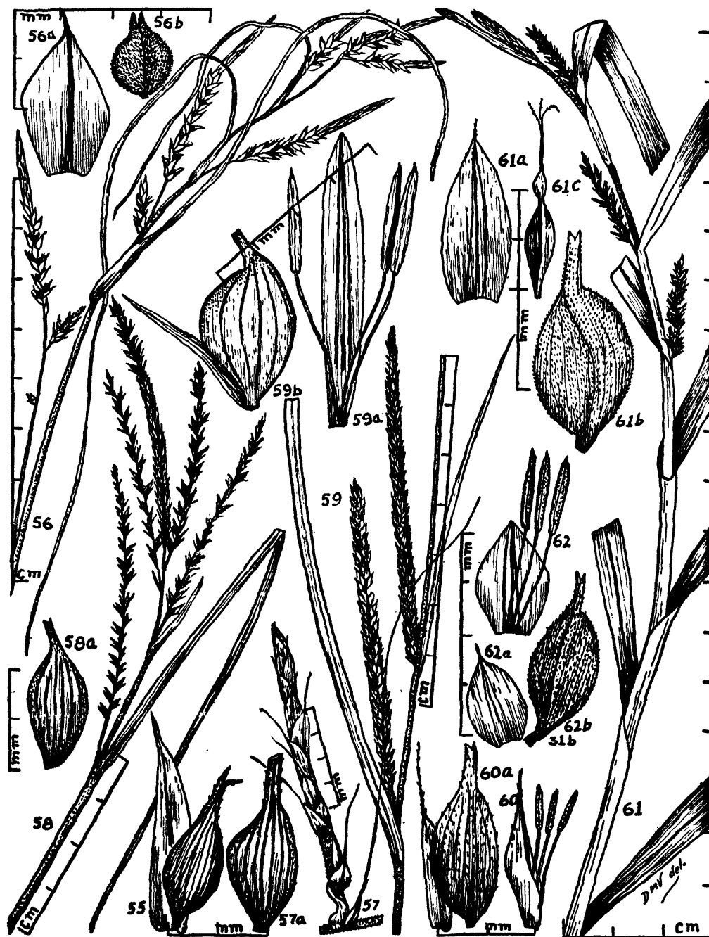
Figs. 55-62 : 55. Carex spiculata Boott. 56-56b. C. composita Boott. 57-57a. C. indica L. 58-58a. C. alopecuroides D. Don. 59-59b. C. olivacea Boott. 60-60a. C. nemostachys Steud. 61-61c. C. ligulata Nees. 62-62b. C. hebecarpa C. A. Meyen.